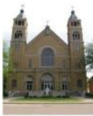
St. Bernard Burkettsville