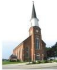
St. Aloysius Carthagena

Served by Missionaries of the Precious Blood since 1845