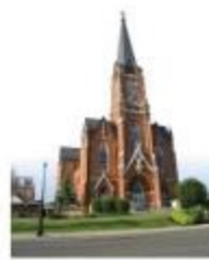
St. Henry St. Henry