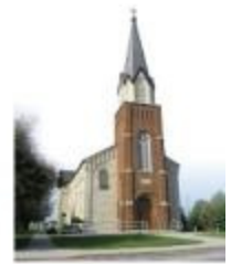
St. Wendelin Wendelin