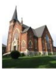
St. Francis Cranberry